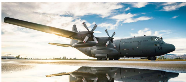
Royal New Zealand Air Force