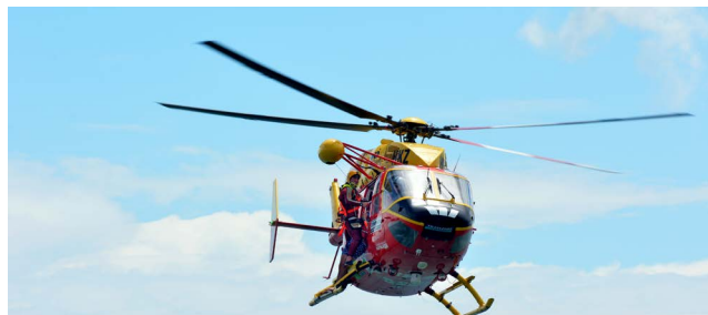
EMS & helicopter operators