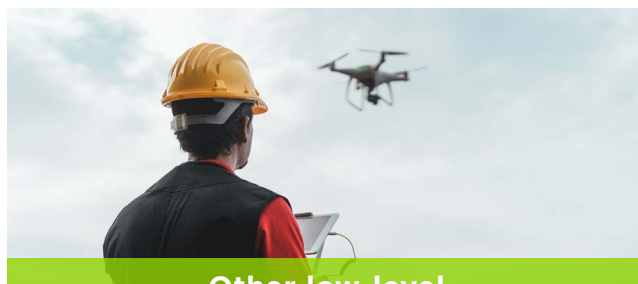
Other low-level airspace participants